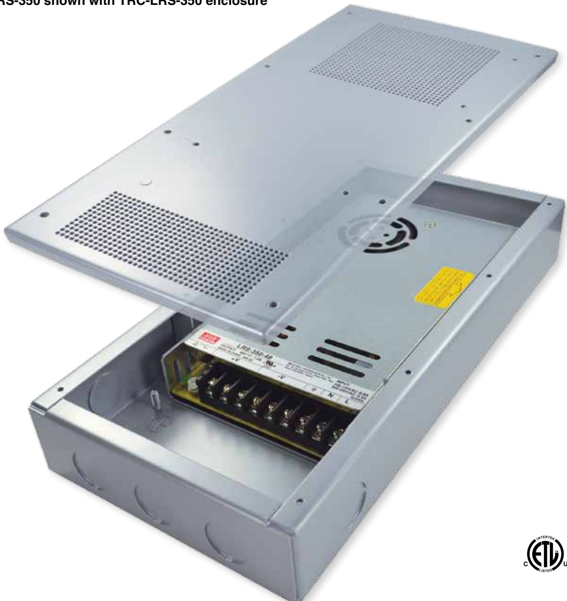
Mean Well LRS-350 shown with TRC-LRS-350 enclosure