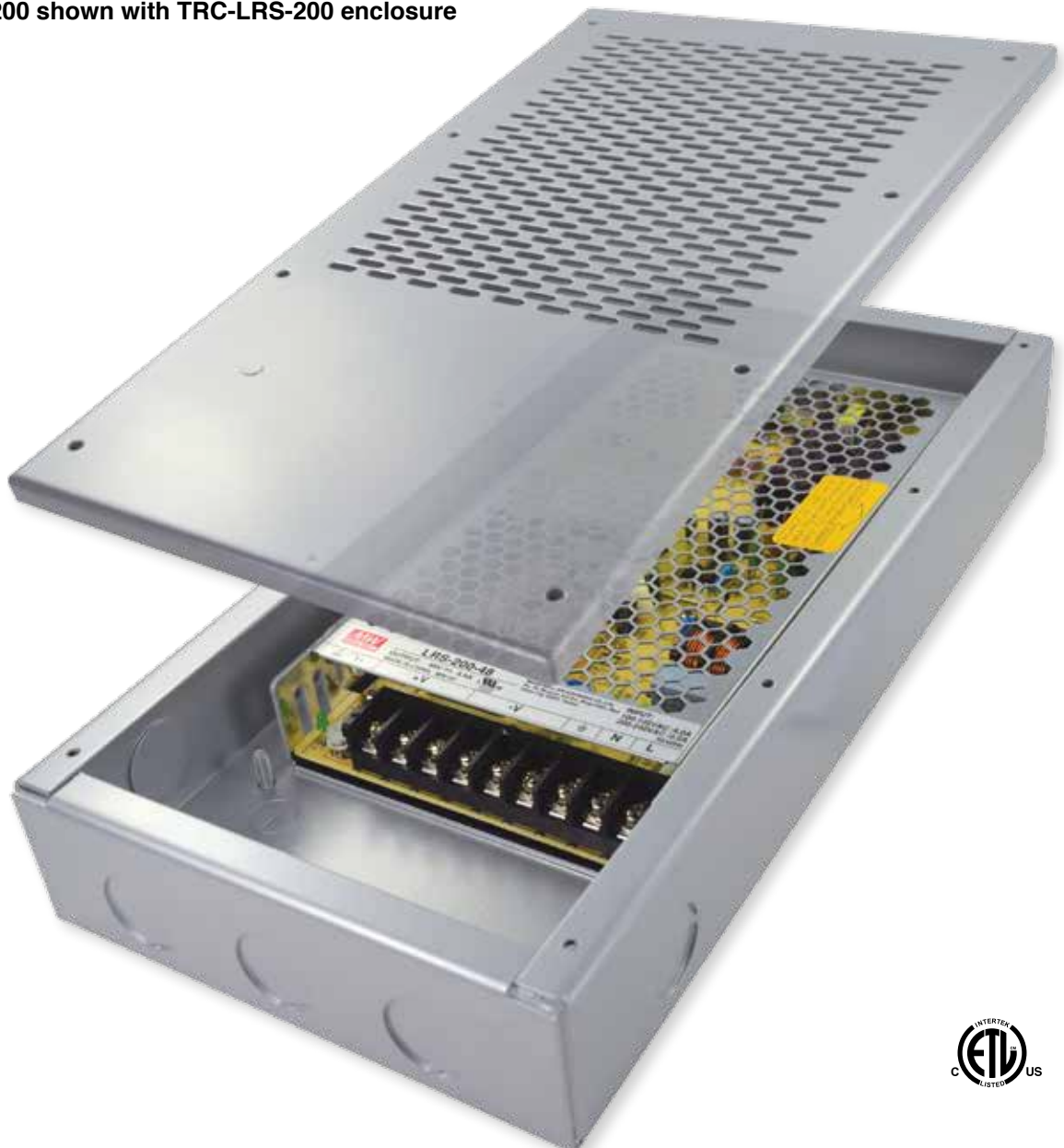
Mean Well LRS-200 shown with TRC-LRS-200 enclosure